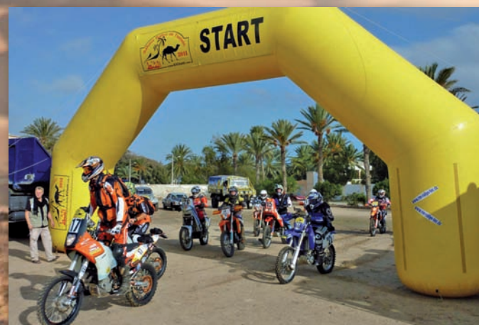
... at that time