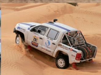
... like today.